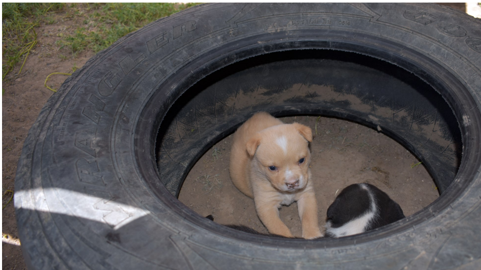
Animals of the reservation in need of food, rescue and forever homes

Many animals are left on the side of the road in Native communities, by unknown individuals living off-reservation, a frequent occurrence known as “animal dumping.”