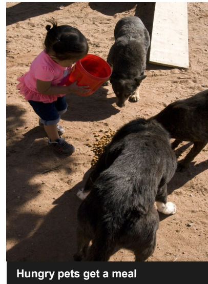
Hungry pets get a meal

In 2016, PWNA supplied veterinary programs and animal care groups on remote reservations with more than 23,000 pounds of pet food and other needed supplies, such as bowls, collars, leashes, and toys to help meet this growing concern. Some RAR partners, such as the McKinley-Gallup Humane Society in New Mexico say, "The pet food, especially the puppy food, is lifesaving!"