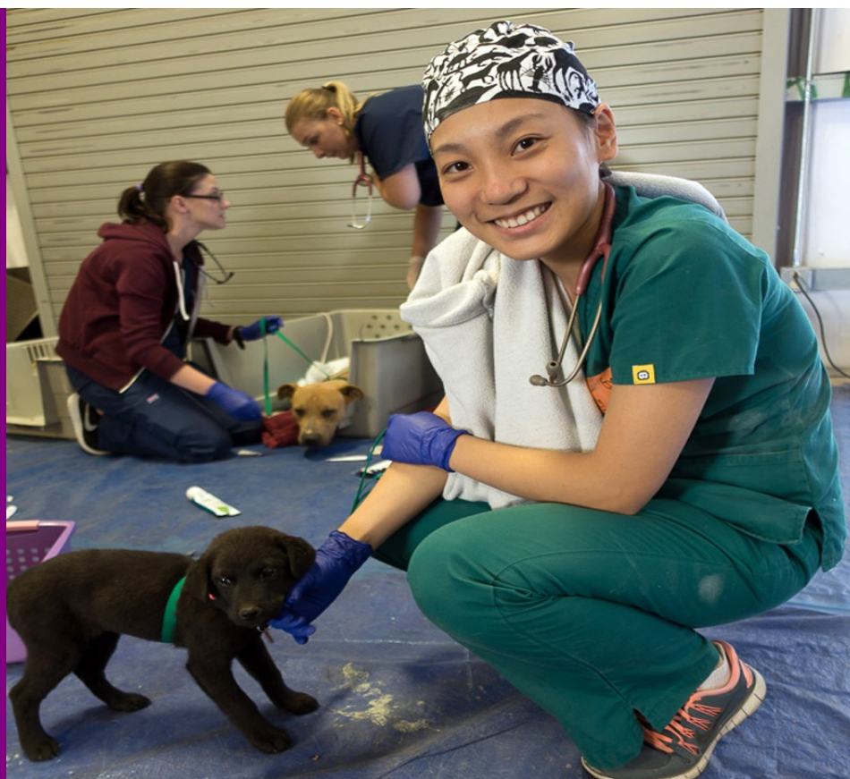
Adorable pup gets love at spay/neuter clinic by RAR collaborator Midwestern University