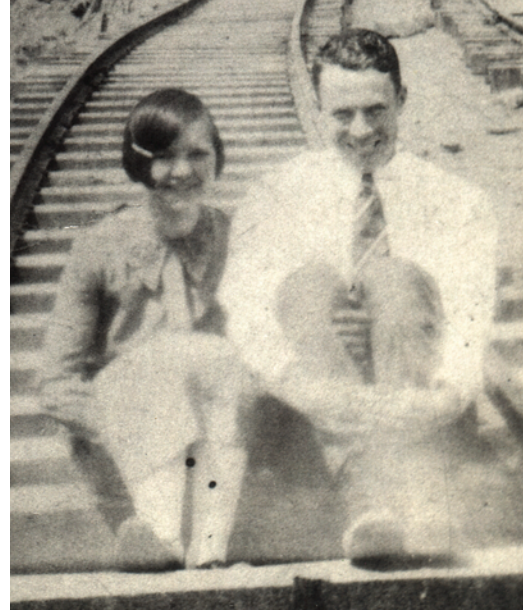
This picture of Woody's mother is a treasured keepsake.

NRC also serves Indian People in Southwest communities where the needs are extreme. Often, these communities lack reasonable access to food, stores, water, transportation, and medical facilities. Like many people who want to